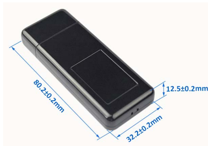
Fig. 2: Overall Dimensions of BDE-USB216

Fig. 2 shows the overall dimensions of BDE-USB216. The USB dongle measures 80.2 mm long by 32.2 mm wide by 12.5 mm high.